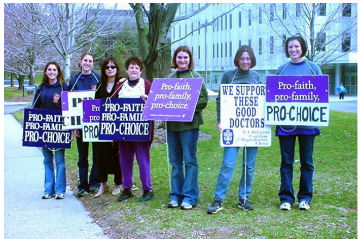
Students and community members at a Peaceful Presence in Morristown, NJ in March 2002.