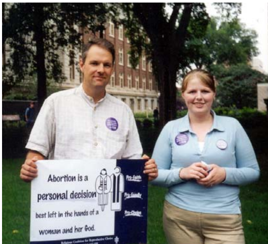
A University Baptist Church Pastor and Spiritual Youth for Reproductive Freedom student at a Peaceful Presence on the campus of the University of Minnesota, September 2002.